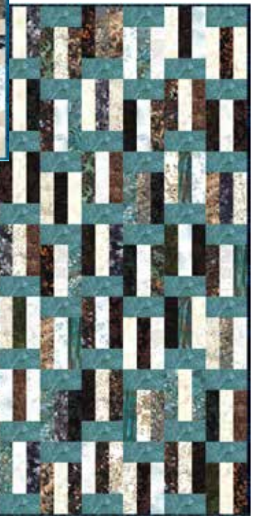
Panama City: 54" x 74"