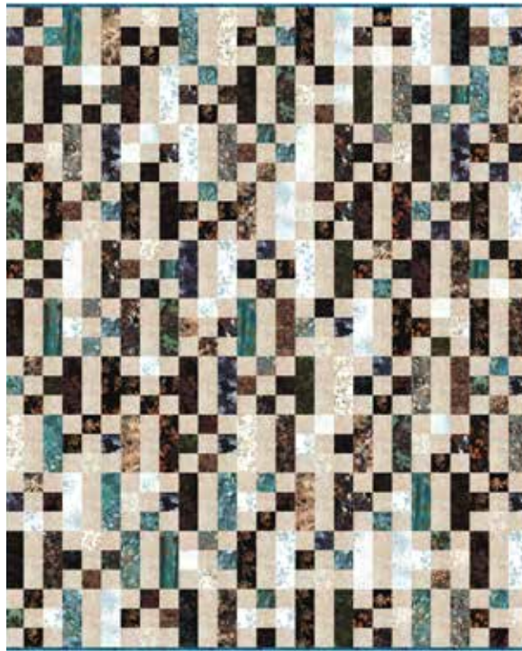
Confetti: 54" x 66"