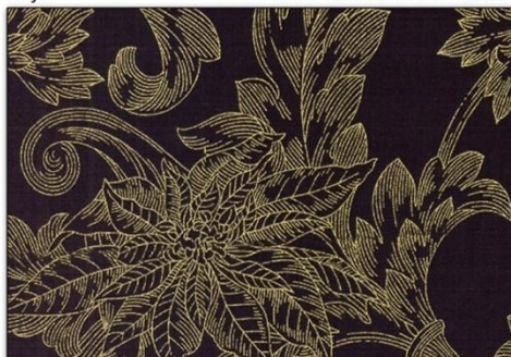
1/4 yd F8084 4G-Black Gold