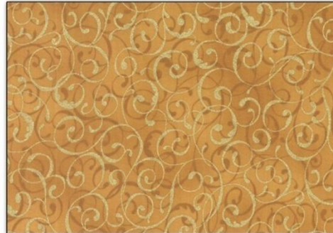
1/8 yd F8087 47G-Gold Gold