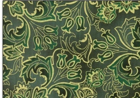
1 yd F8082 60G-Hunter Gold