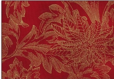
1/2 yd F8084 78G-Scarlet Gold