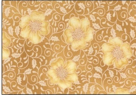
1/8 yd F8088 36P-Amber Pearl