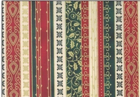
3/4 yd F8081 161G-Christmas Gold