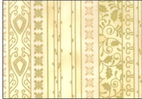
1/8 yd F8081 33G-Cream Gold