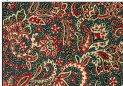
1/4 yd F8085 161G-Christmas Gold