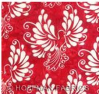
SEASONAL BATIKS H2323-75- PEPPERMINT