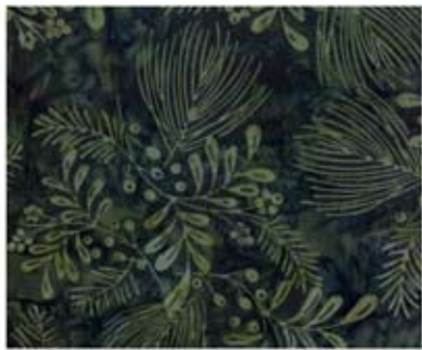
SEASONAL BATIKS H2321-60-HUNTER