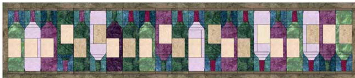
Table runner finishes at 65” x 14”

Press, then add batting and backing and quilt as desired. Attach binding.